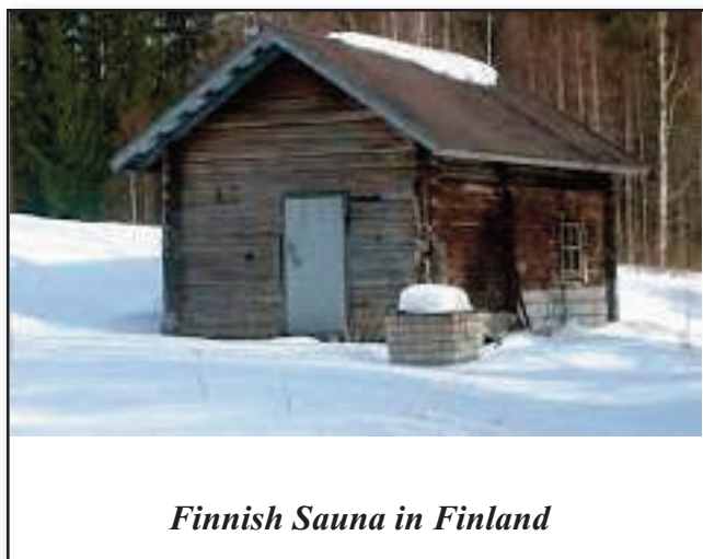
Finnish Sauna in Finland

Finlandia Foundation National has declared the last week in February “National Sauna Week” to build awareness and appreciation of this aspect of Finnish and Finnish-American culture.