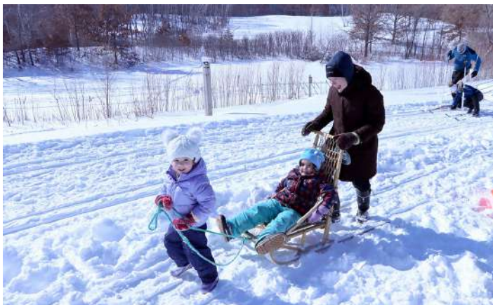
Kicksledding at Laskiainen

by sliding down a snow covered hill and eating fatty meats and soft cardamom flavored buns, Laskiais pulla.