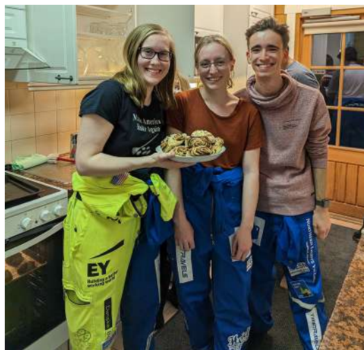
Spring semester fun!

Hope you are enjoying the fresh snow in Minnesota!