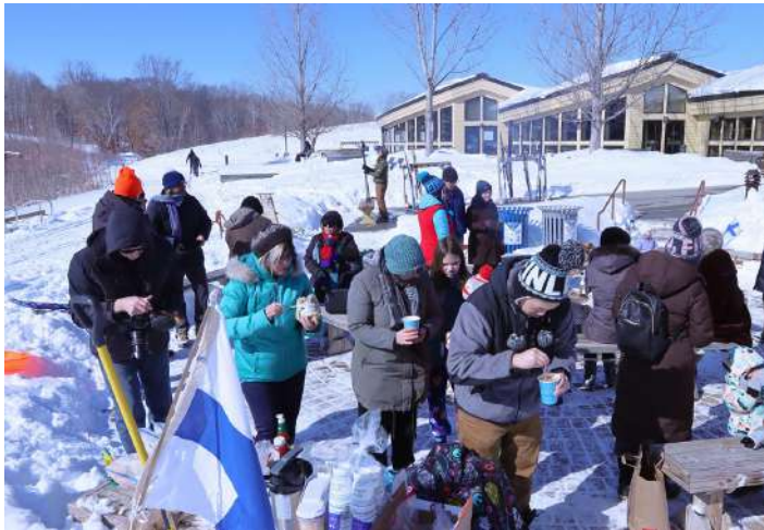
Conversation around the firepit.

Laskiainen, Shrove Tuesday and Mardi Gras are celebrated the Tuesday before the beginning of Lent and typically mark the time when people think about putting away winter activities and start looking toward spring. Finnish tradition celebrates